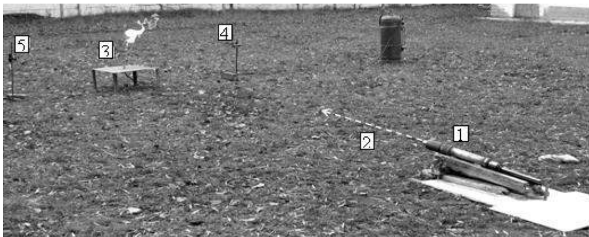
Fig. 3 Schematic of the experiment on fire gas flare at the landfill. 1 – gunpowder impulse water cannon, 2 – impulse jet of liquid, 3 – gas torch, 4 – laser unit, 5 – speed meter

The field experiments were conducted using the basis of the investigations. Powder IW 1 was placed at a distance from 5 to 15 m to the gas flare 3. IW jet was directed to the right place at the well flare using the laser sight. Gas flare fed from a cylinder of liquefied gas, whose flow rate was determined using a pressure gauge mounted on the cylinder valve. In the experiments distance from the pulse water cannon to flare and the value of the powder charge, which influenced on the speed of the liquid pulse jet, was varied.