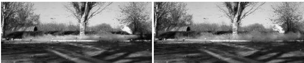
Fig. 6-7. Photos of experiment.

Figure. 4, we see the process of the jet flight from water cannon, its form is compact, like a knitting needle. In some areas, there is thickening of the jet which in Fig. 5 are significantly enhanced. However, in Figure 5 the jet remains dense and uniform, as can be judged based on its opacity.