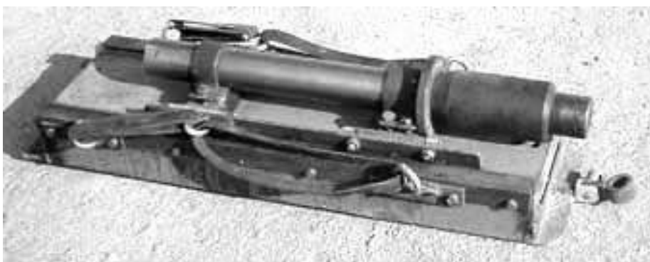
Fig. 1 Impulse water cannon

It's important for the successful use of this technique to choose not only just the kind of extinguishing agents, but also the speed of the jet, which plays a key role. Creating of pulse of high-speed jets is made by using a special installation - powder impulse water cannon (IW) (Figure 1).