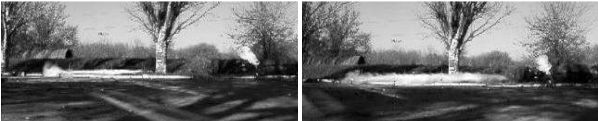
Fig. 4-5. Photos of experiment.

The analysis of video that was recorded during the experiment, shows the next series of photos: