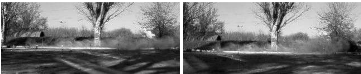
Fig. 8-9. Photos of experiment.

In Fig.6 the pulse jet has almost reached the orifice of the torch, we are watching a significant change in its form and structure. We can distinguish the jet center and the outer part which has a kind of "jags" in the direction to the flare. In Fig. 6 jet crosses the center of the flame and "rip" it from the gas source. Fig. 7 shows that the spray head is located beyond target, and a cloud of fine spray keeps moving, "isolating" the flame.